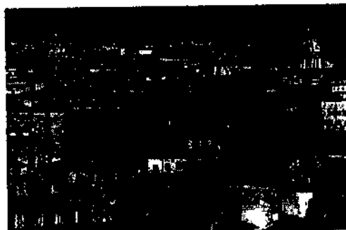
Historic Centre of Rome